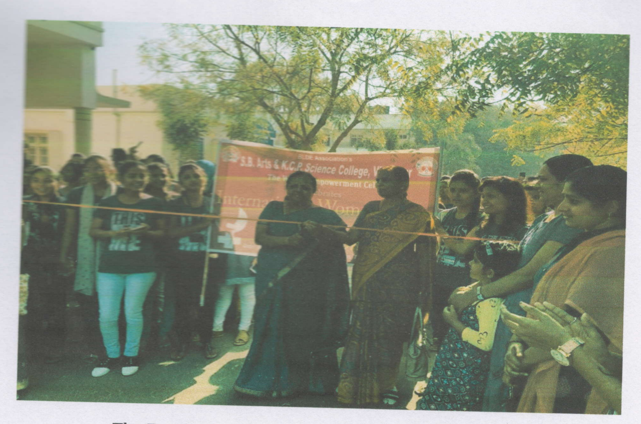
The Faculty Inaugurating the Walkathon