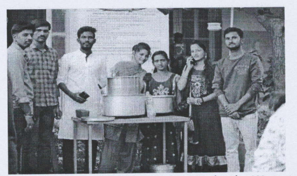
Students participated in the 'Stall Fest' held in the Campus by the Women Empowerment Cell

The theme of the International Women's Day "#balanceforbetter" was observed and catalogued by the Stall Fest. The Boys and Girls of the College held Food Stalls. Together it was a team work that worked and made this Event more meaningfully rejuvenating and deliciously flavored.