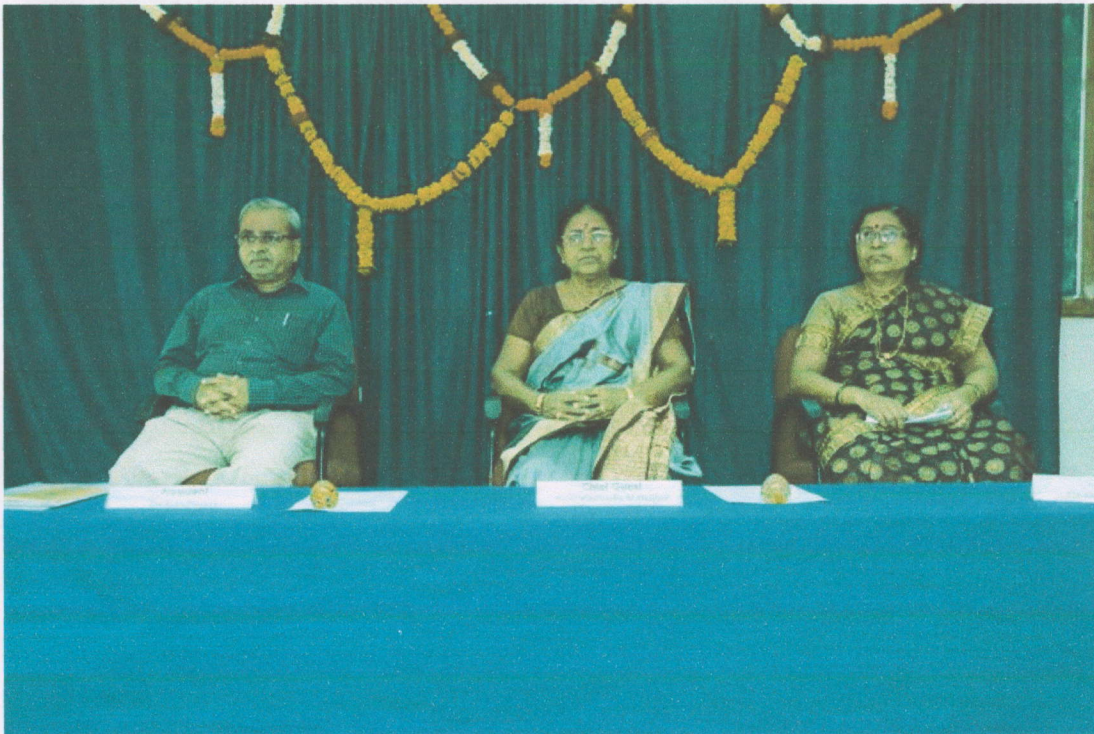
The Chief Guest, Principal

A Orientation of the making of Jute Bags was organized by the Women Empowerment Cell on 29-09-2017 .This was held by the Cell with a motive to Empower Women by building in her an Entrepreneur and also to build the atmosphere of Creativity and create an awareness of the Eco-friendly product ,Jute.