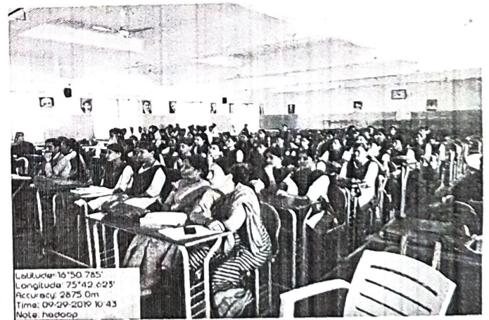
Students attended for the workshop