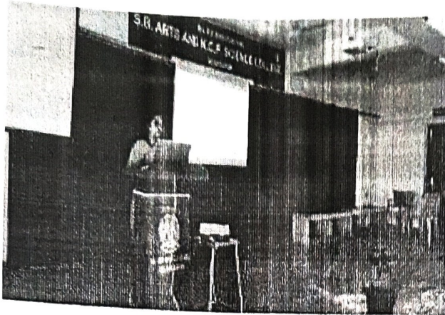
Technical Presentation by Resource Person