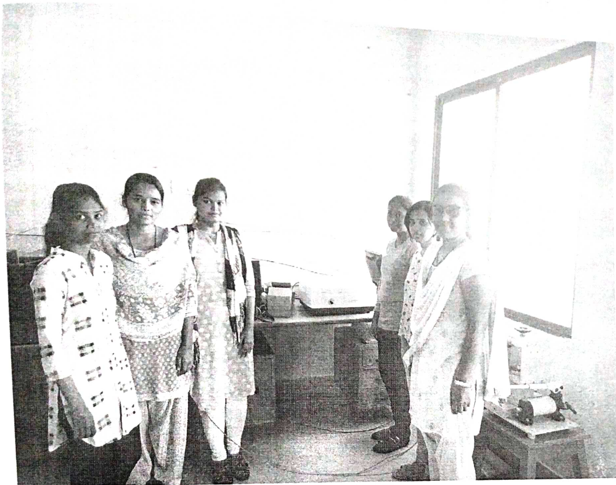
K.C.P Students at KSAWU, visited on 19/2/2020

Head Dept. of Chemistry SB Arts & KCP Sc. College, Vijayapur.