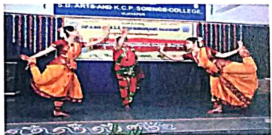
Entertainment programs in Closing Ceremony

Principal, S.B. Arts and KCP Science College, VIJAYAPUR