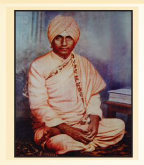
H.H.Sanganabasava Swamiji of Banthnal