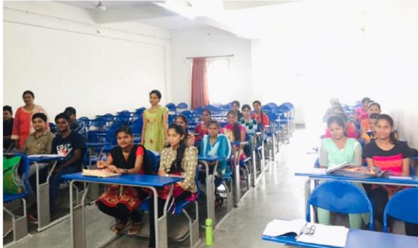
The Faculty and Students of B.C.A in the Bridge-Course

“Effort and Hard work construct the bridge that connects your dream to reality”.