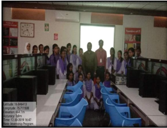
The Faculty involved in the Internship