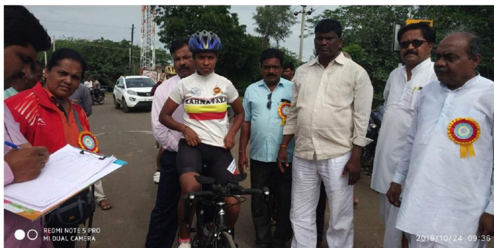
Student during the National Level Cycling Competition