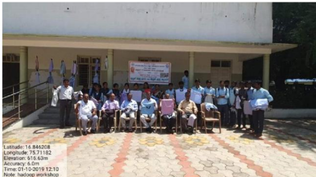
Distributing Cloth Bags to Faculty ,Staff and Students.