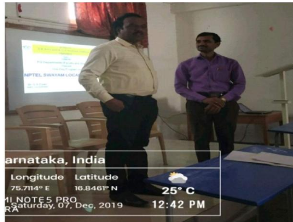
The Address of the Awareness of the NPTEL Programme