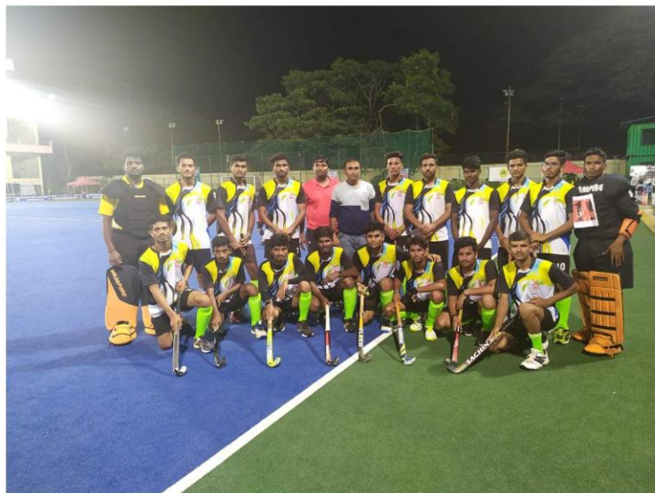
Hockey Team of our College in Hockey University Selections and Tournament