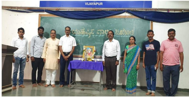
Celebration of Valmiki Jayanti ,Principal & Faculty