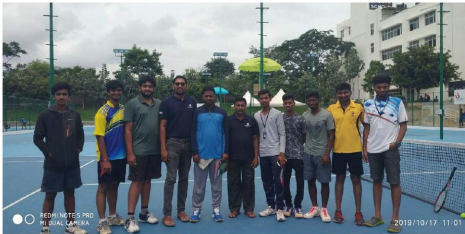
Lawn Tennis Team of our College during their participation in Bengaluru