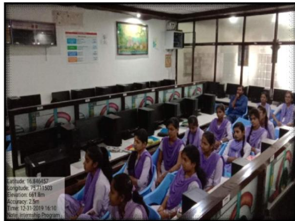
The Student-Attendees for the Internship