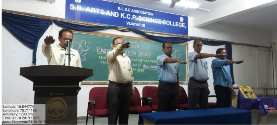
On the eve of Rastriya Ekta Diwas all Faculty and Students taking Oath.