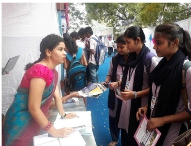
The Faculty of our College providing information to the Students at the Stall-Counter

The Students of various Colleges of Vijayapur, Bagalkot, Kalaburagi, Belagavi Districts participated in this Open Day and Exhibition. 120 Students registered in our College Counter. The information regarding the Courses and facilities of our College were given to the Students. Later all these students visited our College Campus . The Departments ,Class Rooms ,Library and Laboratory facilities were witnessed by the Students .