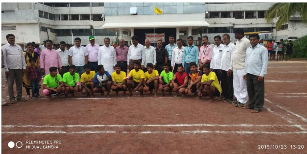
Kabaddi team participants organized by the First Grade Degree College at