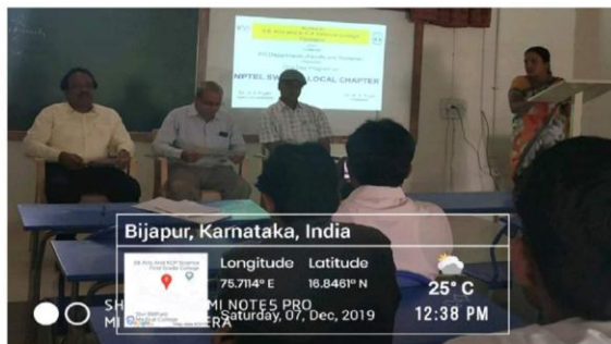
Dignitaries at the Inauguration of NPTEL Programme

An Awareness Programme for Teacher and Student Enrollment for NPTEL Swayam was held on 7th December, 2019. The National Programme on Technology Enhanced Learning (NPTEL) has brought in new spirit into its process. The main focus of this Programme was quality Instruction and Education in select Topics and Skills . This improves and widens their knowledge base, get introduced to new domains. Faculty members teaching the Courses in Colleges can hone their teaching skills and use this material to supplement their teaching. Course instructors - may utilize this opportunity to connect with a wide spectrum of student community. Industry can use the courses to reduce training time, broaden and refresh the skill set of their employee. In tune with this an Awareness Programme for Teacher Education Institutions was organized on 07/12/2019. Around 50 participants, comprising of Principal, IQAC Coordinator and Faculty from various Departments participated in the Programme.