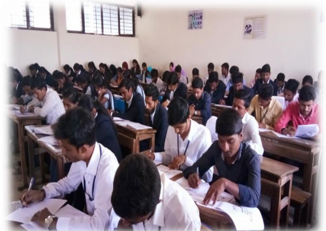
Infosys Campus Drive Written Test