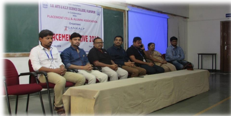
Sankalp Semi Conductor Campus Drive