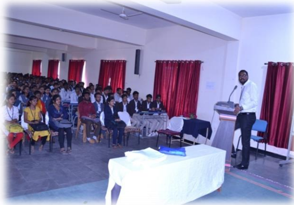
Infosys Campus Drive