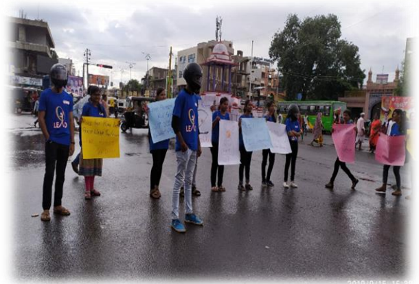
Traffic Awareness by LEAD