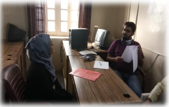
Cognitive Clouds Campus Drive