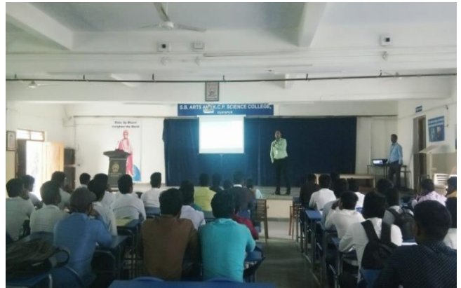
Svanantra Microfin Campus Drive talk