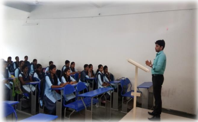
Placement Plans for 2019-20