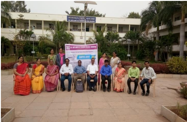
Wipro Wilp Campus Drive