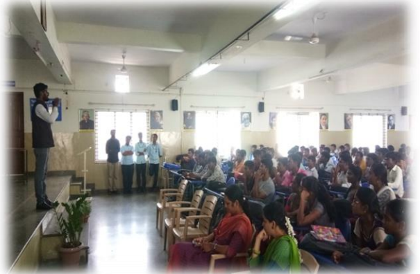
LEAD Orientation for BCA