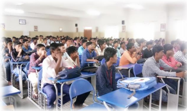
LEAD Orientation for BA and B.Sc