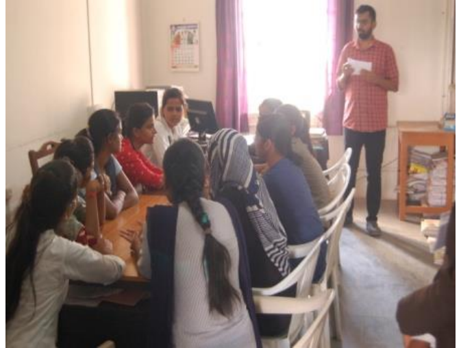
Cognitive Clouds GD