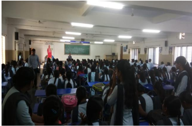
ICS Dharwad Career Guidance