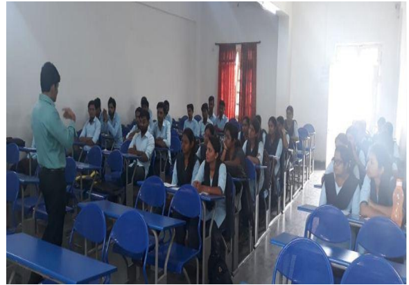
Placement Plans B.C.A