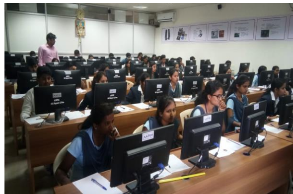
Wipro Wilp Campus Drive