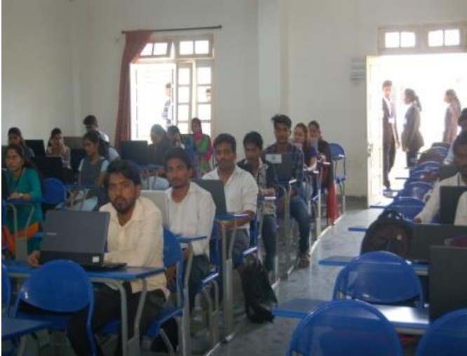
Cognitive Clouds Online Test