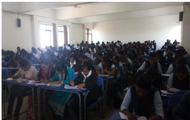
Infosys Campus Drive