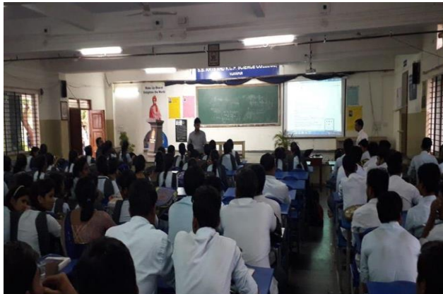
Placement Plan for AY