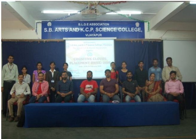
Cognitive Clouds Final Selected Students