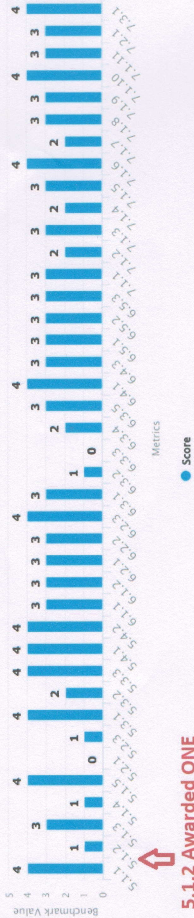
Fig: Performance of metrics In Criteria V,VI & VII