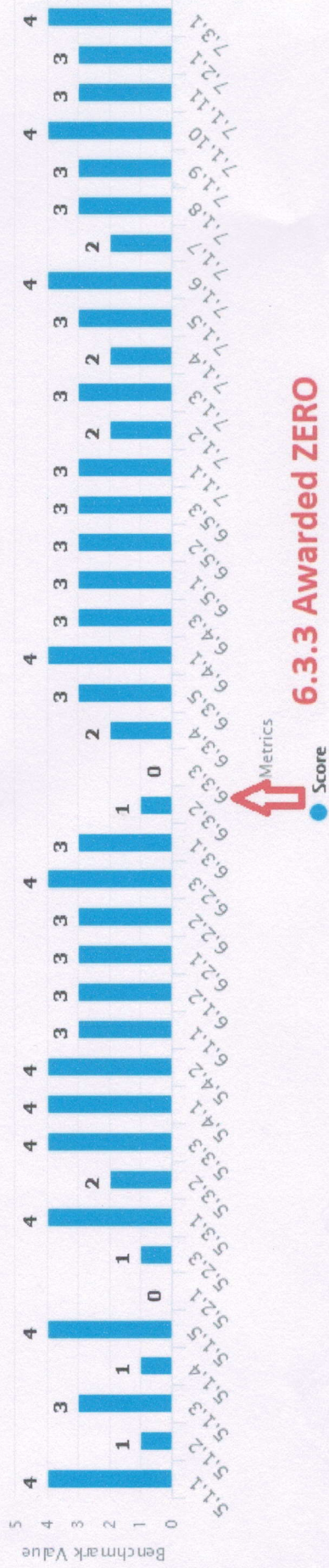
Fig: Performance of metrics in Criteria V,VI & VII

IQAC, Co-ordinator S.B.Arts & K.C.P.Science College, Vijayapur.