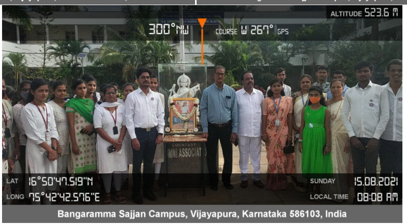
"AZADI KA AMRUT MAHOTSAV VANA – 15/08/2021"