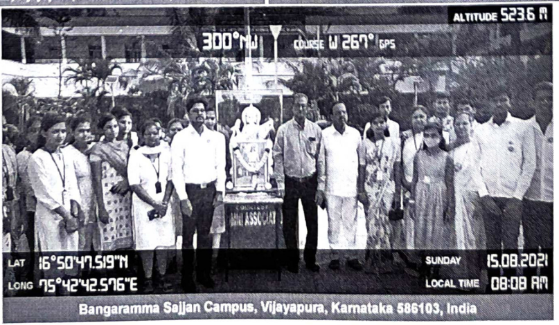
"AZADI KA AMRUT MAHOTSAV VANA - 15/08/2021"