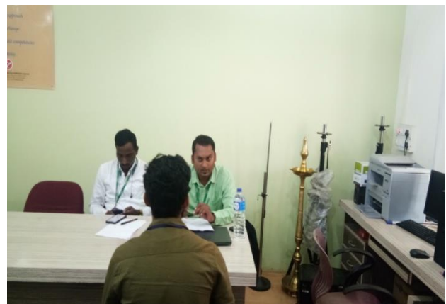
Document Verification & PI