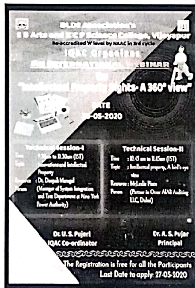
The Flyer of the Webinar

The Intellectual Property is the much required field in the present scenario. The Webinar was arranged with the two Technical Sessions with the much experienced Resource Persons.