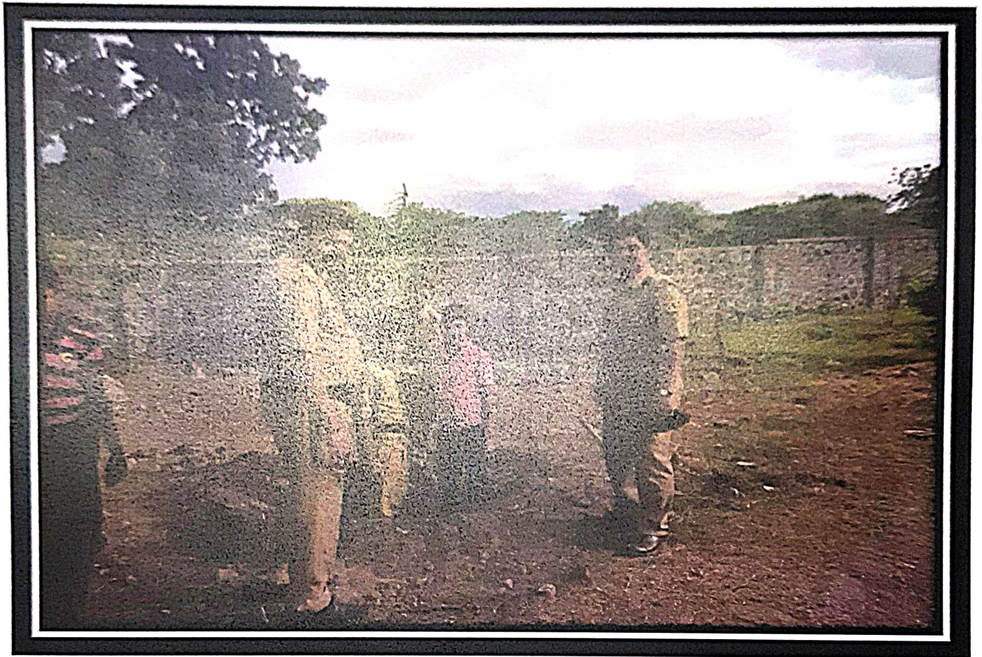
"Begam Talab park" Celebration of world Environment Day