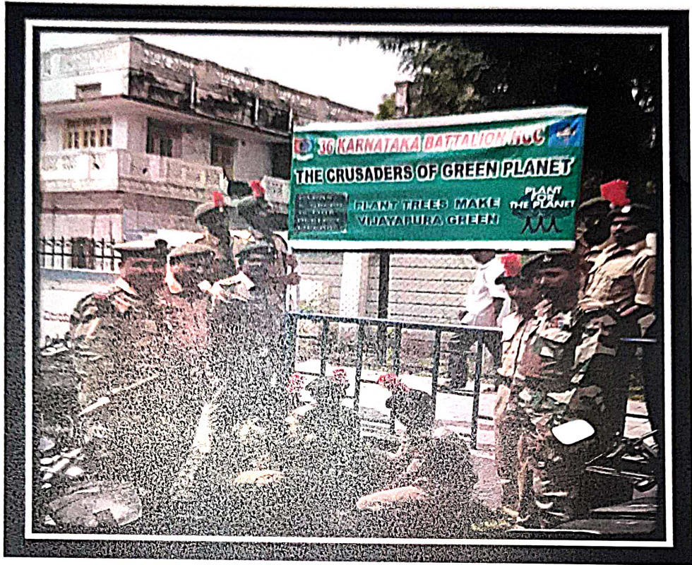
GANDHI CHOWK VIJAYAPUR