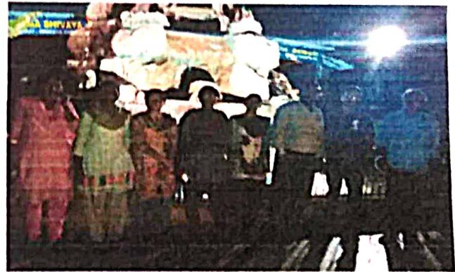
Watching light & sound show- T.B. Dam