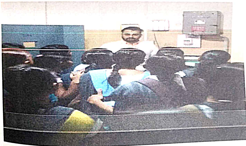
VISIT TO MEDICINE DEPARTMENT