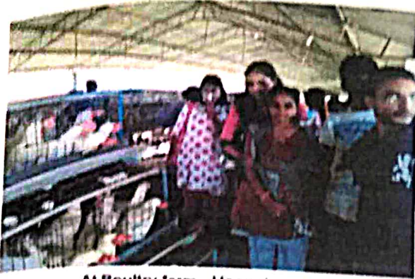
At Poultry farm -Hospet