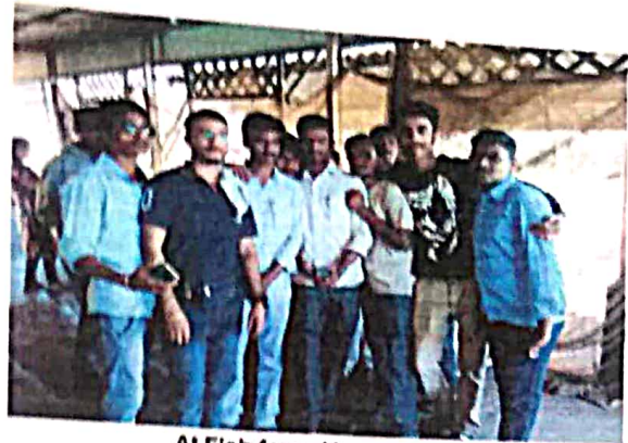
At Fish farm -Hospet