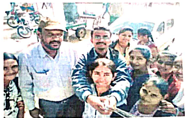
At Chamundibet -Mysore