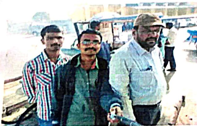
At Chamundibet -Mysore