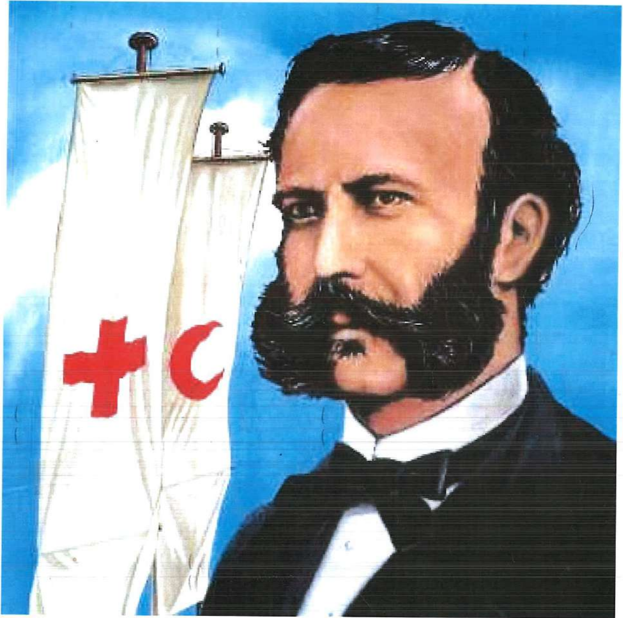
JEAN HENRY DUNANT FOUNDER OF INTERNATIONAL RED CROSS ORGANIZATION