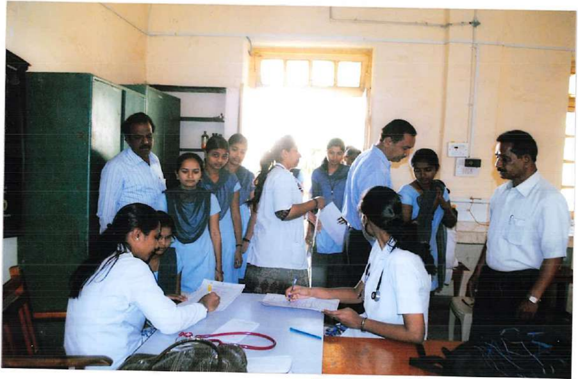
Doctors checkup the students health.