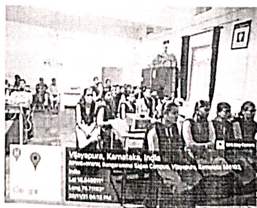
Students Watching TED-TALK

Head Department of Physics S.B.Arts & K.C.P.Science College Vijayapur-586103.